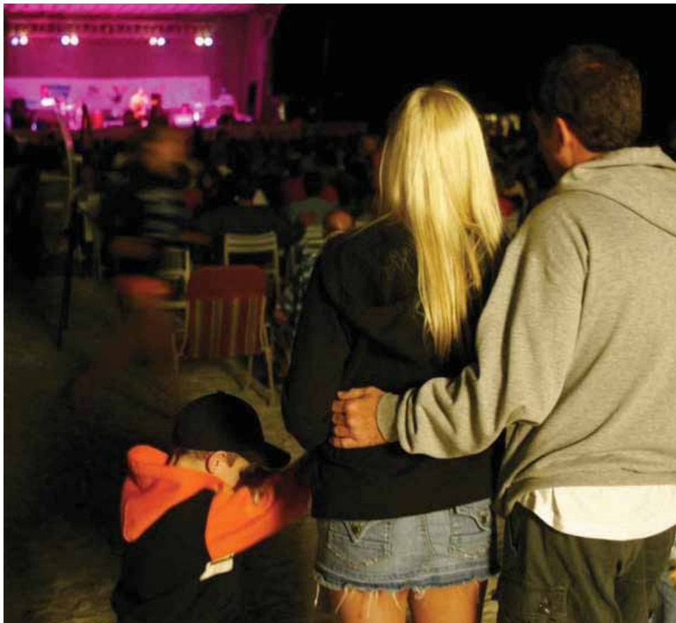
A loving family listens to a live band among the estimated 3500 people in attendance at the Marco Island 1st Annual Beach Music Festival on Saturday. It was a day filled with a food competition, live music, raffles, fireworks and the event gave its proceeds to Children's Miracle Network, American Cancer Society, Marco Island YMCA, Friends of Rookery Bay.